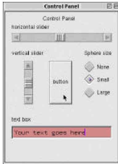
Figure 11.1: the set of MUI facilities on a single window

MUI object callbacks are optional (you would probably not want to register a callback for a fixed text string, for example, but you would with an active item such as a button). In order to register a callback, you must name the object when it is created and must link that object to its callback function with